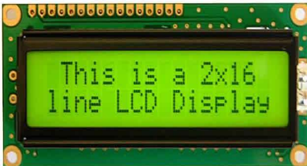
Fig. 1.2: LCD display